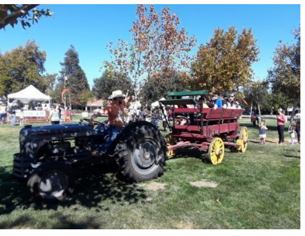
Dublin Harvest Fair's information center and tractor ride (above), and Emeryville Harvest Festival's giveaway booths (below).