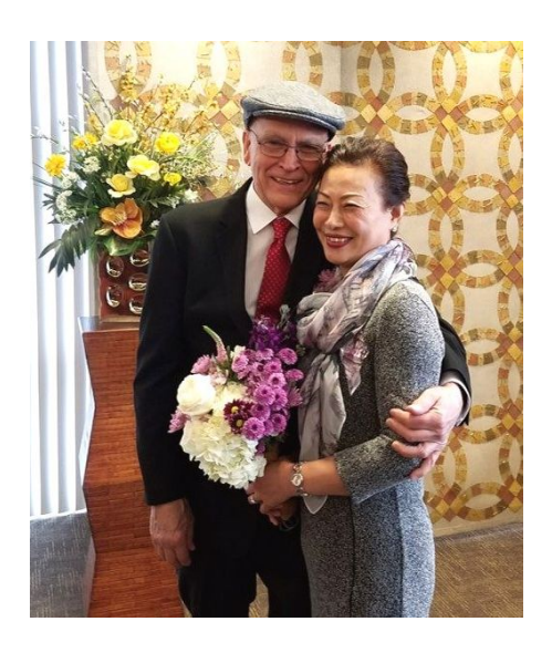
Plan ahead to help us create a beautiful day!

Due to high demand and limited availability at other counties, demand for our marriage services have increased significantly. As a result, it could take several weeks to get the services you need. If you are planning to get married over the holidays or in the near future, here are some tips to help make your preparations a little easier.