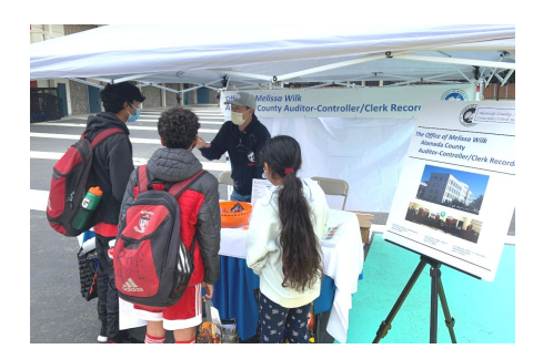
Auditor-Controller/Clerk-Recorder staff at the Dublin Harvest Fair (left), and at the Emeryville Harvest Festival (right).

The Auditor-Controller/Clerk-Recorder Agency was excited to support the return of Dublin's Old-Fashioned Harvest Fair on October 9 and Emeryville's Spooktacular Harvest Festival on October 30.