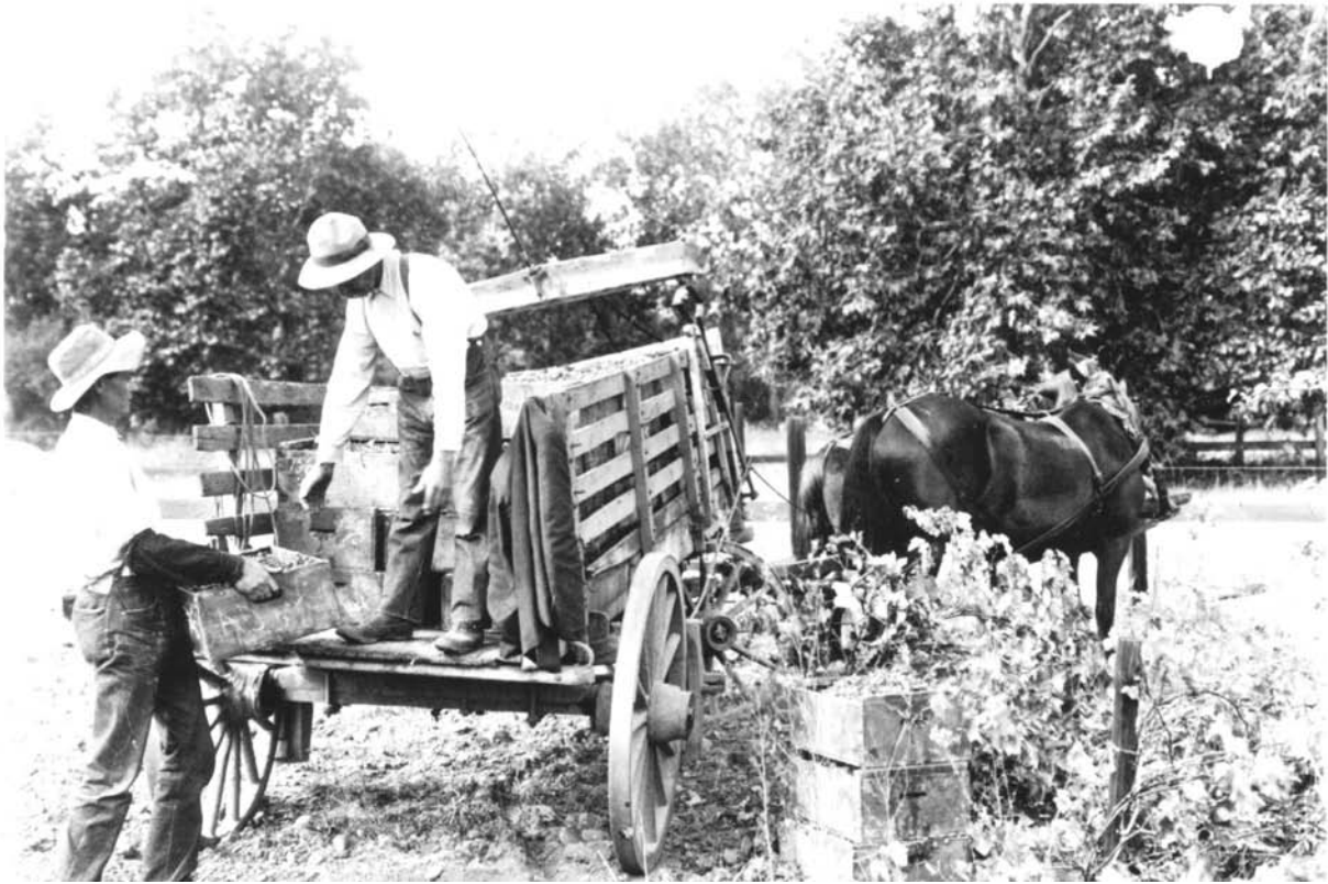
Grapes loaded for trip to Cresta Blanca Winery, Livermore, 1911.