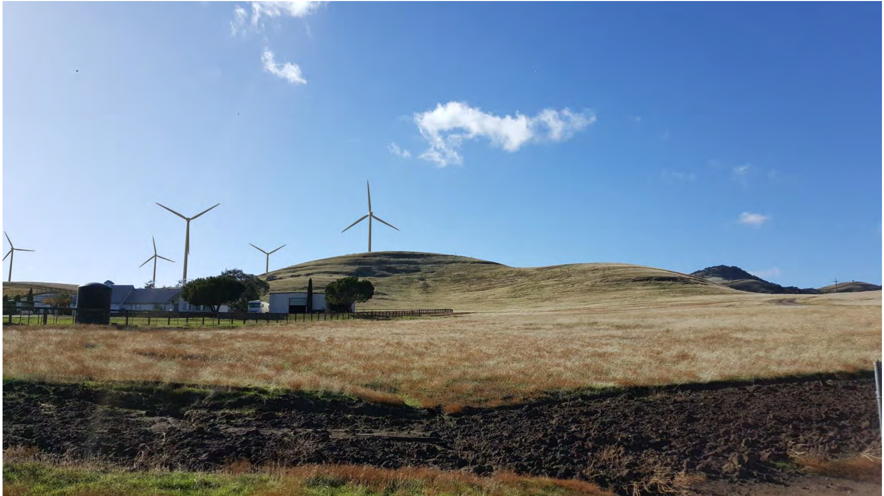
CAMERA POSITION 3: VIEW SOUTHWEST TOWARD TURBINES 23 AND 24 - SIMULATED PROPOSED CONDITIONS