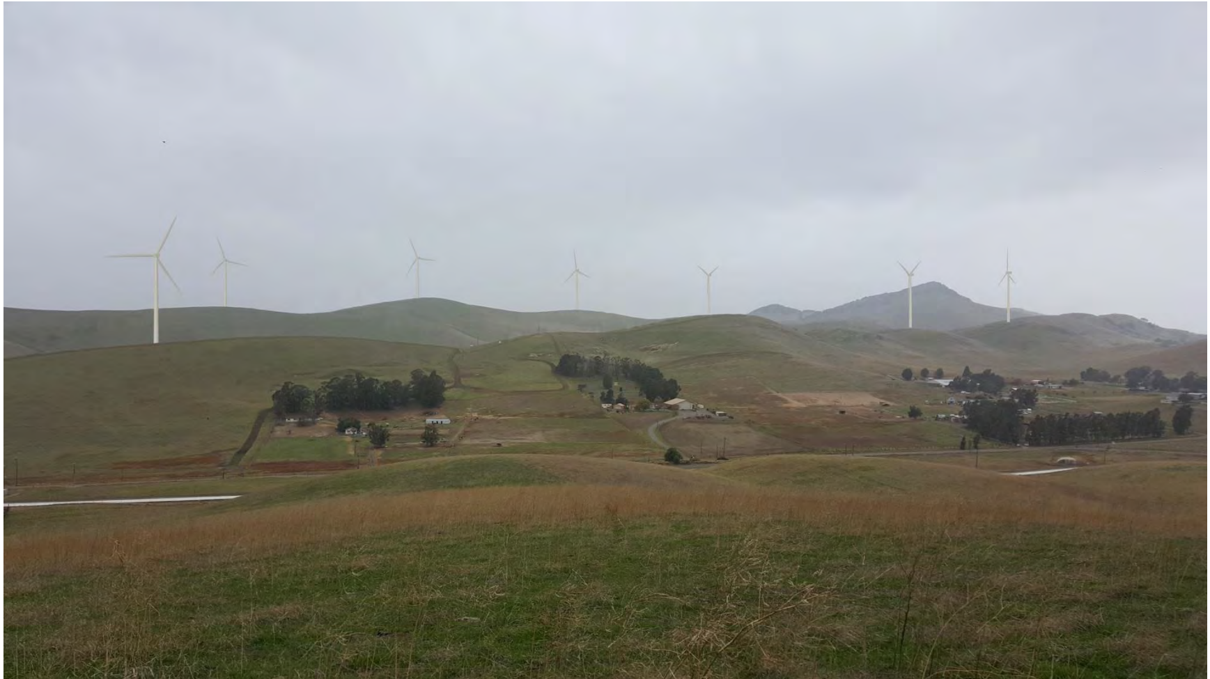
CAMERA POSITION 4: VIEW NORTHWEST TOWARD DYER ROAD RESIDENCES -PROPOSED CONDITION