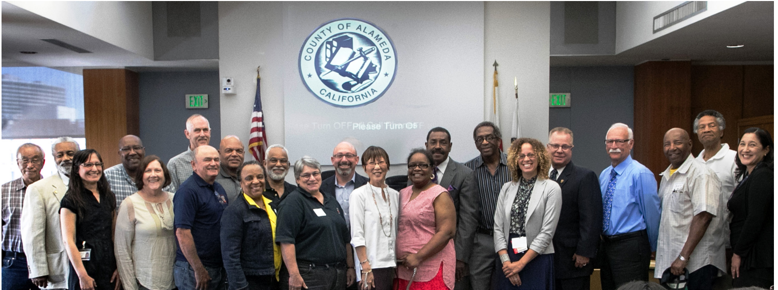
County Supervisors gathered on July 11 with Veterans Art Program participants and organizers

On July 11, the Board of Supervisors honored local veterans and the Oakland Vet Center for their participation in the Veterans Art Program. Coordinated by the Alameda County Arts Commission, the innovative program brings creative expression workshops to the Oakland Vet Center to enhance an array of crucial services provided to Alameda County veterans and their families.