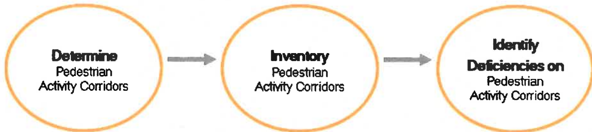
Figure 2: Self-Evaluation Process

Pedestrian Activity Corridors were identified, as specified in the ADA, as walkways serving government facilities, transportation, place of public accommodation, and places of employment. Specifically, the criteria are shown in the below list alphabetically: